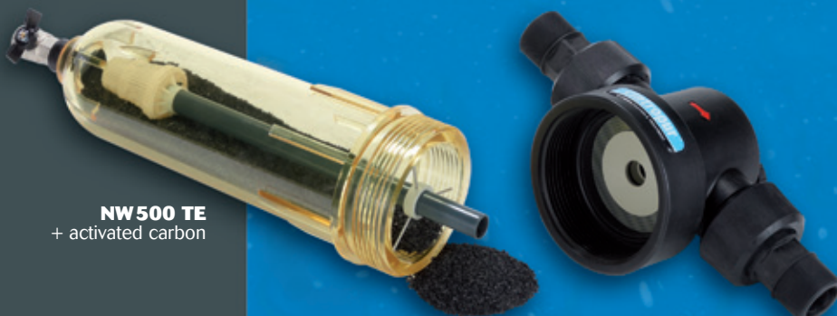
NW 500 TE + activated carbon

The activated carbon CINTROPUR is sold separately and is highly suitable for the improvement of taste and the removal of odour, chlorine, ozone, micropollutants such as pesticides and other dissolved organic substances.